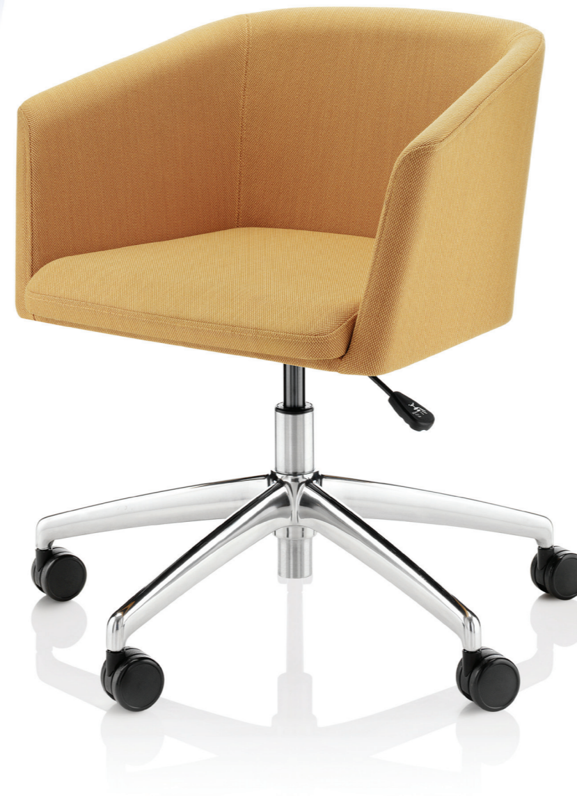
This image shows the low back Toto chair on a polished 5 star base with tilt mechanism.