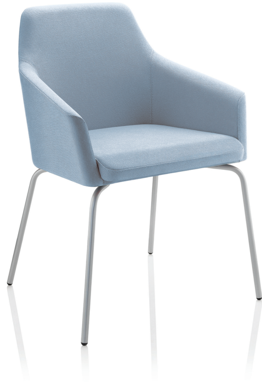
This image shows the high back Toto chair on a 4 leg powder coated steel base.

Combining style and versatility Toto is a family of multi-purpose chairs. Ideal for the demands of the modern workplace, the range is suitable for meetings rooms, breakout areas, dining areas and hospitality environments.